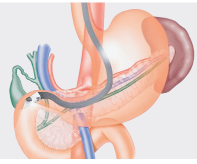
Endoscopic ultrasonography (EUS)