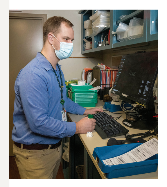
The UHS Specialty Pharmacy located at UHS Binghamton General Hospital helps patients get the unique medications they peed

Once patients are onboarded and under the UHS Specialty Pharmacy's services, the liaisons call them to go over everything patients need to know about their treatments, including dosage information and delivery dates, as well as to make sure they adhere to their medications by asking if they have any problems or questions. The liaisons then relay need-to-know information from patients to the pharmacists or clinical staff.